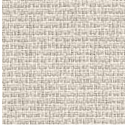
Paris Frost 7020