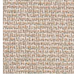
Baxter Beige 7011