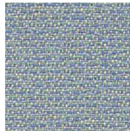
Kennebec Blue 7041