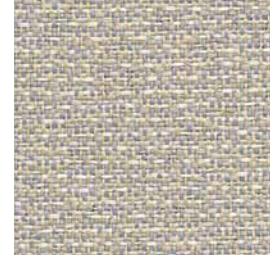
Allagash Mist 7040