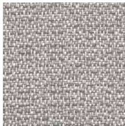
Sherman Pewter 7024