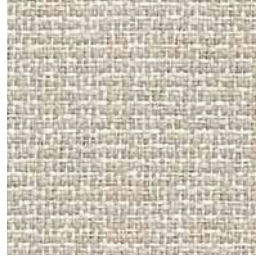
Belmont Silver 7010